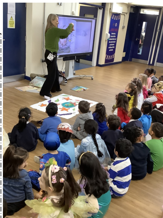
World Book Day—Author Visit Workshop

Tuesday 23rd April - Year 1 - History off The Page