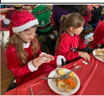
All the children had Christmas Lunch compete with crackers and dessert!

total of £230 was raised for Children in Need and £158 was raised on Christmas Jumper Day.