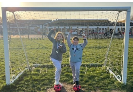
Players of the tournament