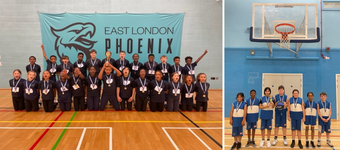
Y5/6 Sportshall Athletics - Ist place (Qualified for Newham Finals in January)